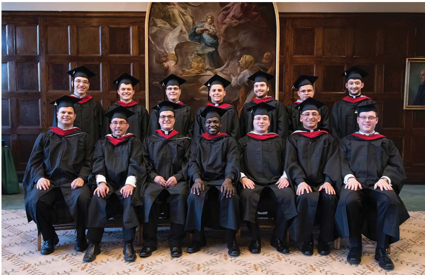
Graduation Day, May 14, 2015 – Deacon Class