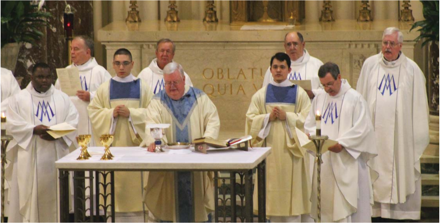
Year-end Mass, May 8, 2015