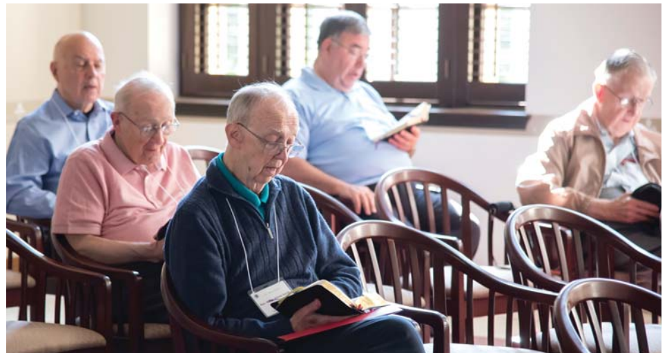
Participants of the Senior Priest Retreat in the St. Charles Chapel for Morning Prayer – May 26, 2015.