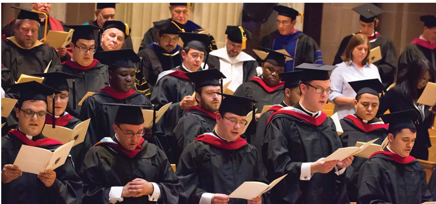
Graduates of the School of Theology, May 14, 2015.

Parish, 115 West Parkway, Compton Plains, NJ 07444.