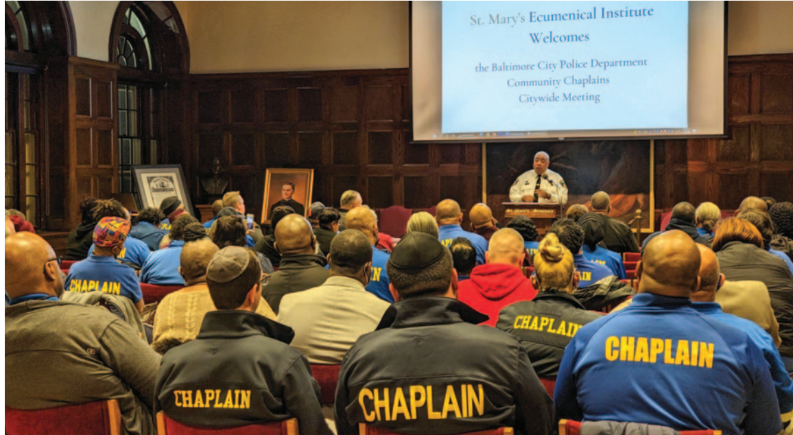
Baltimore City Police Department chaplains gather in Laubacher Hall at an event hosted by the EI, which led to offering a fall Trauma & Healing workshop in partnership with ICJS.