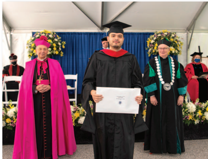
May 6, 2021