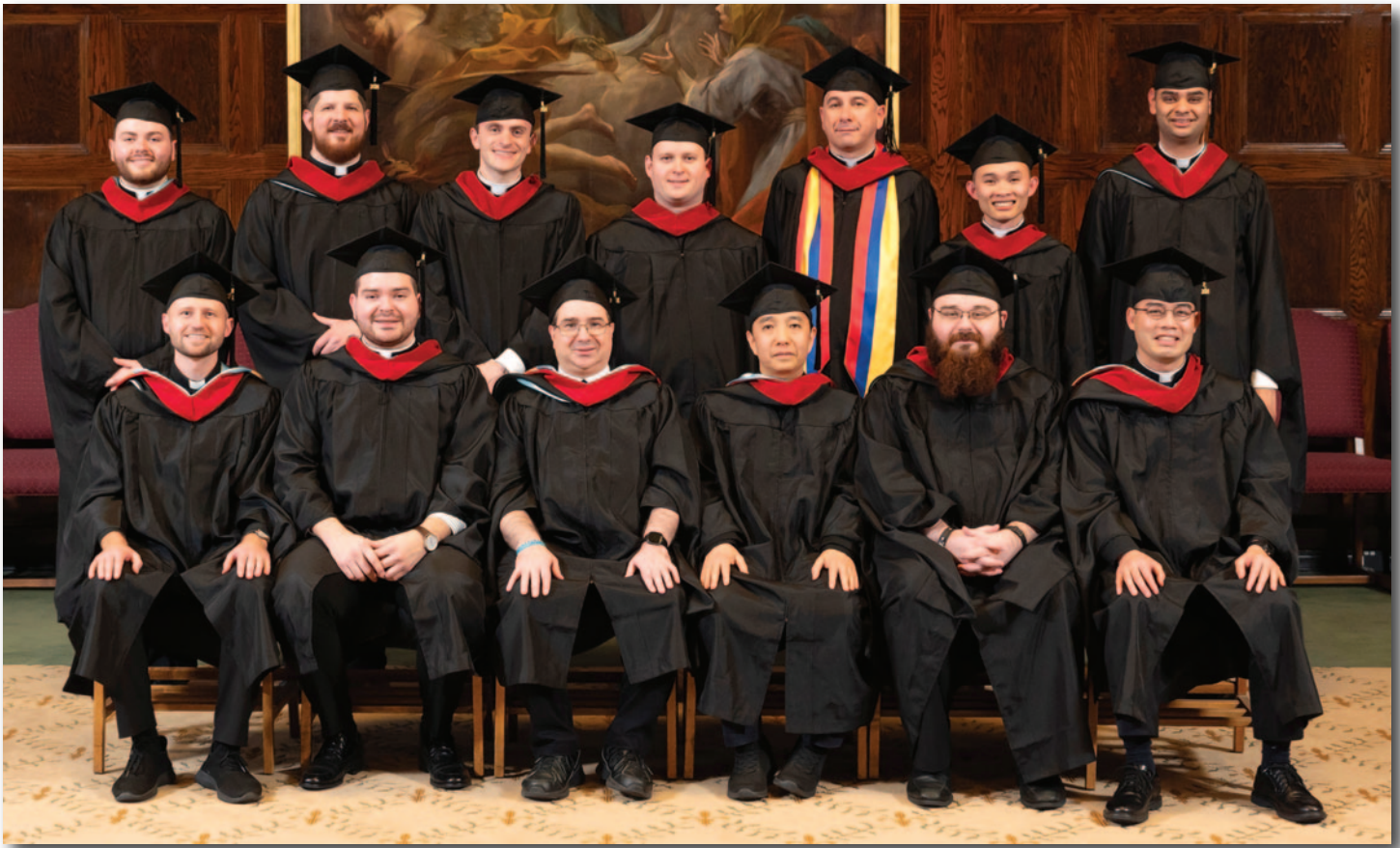
Fourth Year Class, May 9th, 2024