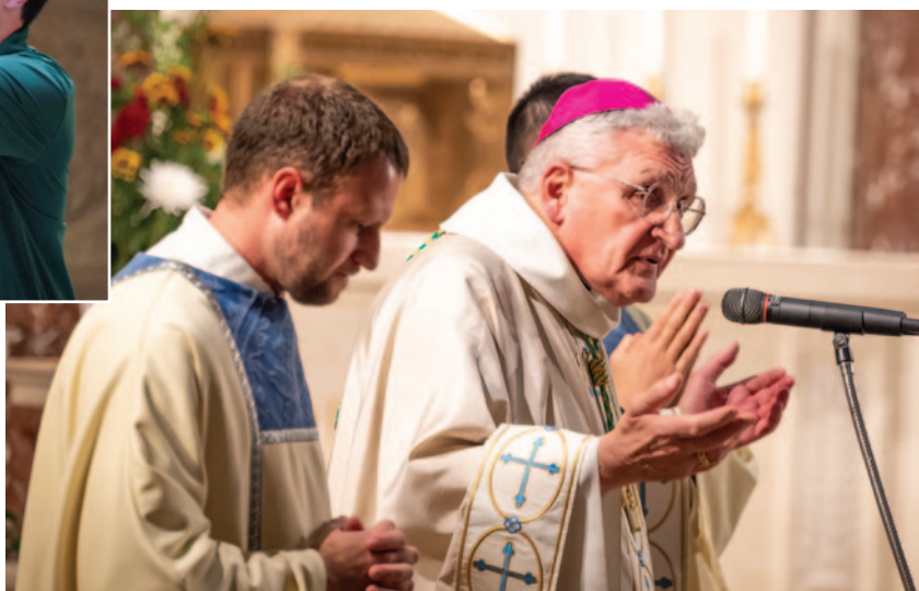
Bishop David Zubik, Bishop of Pittsburgh (SMS 1975), celebrates Mass for the Rite of Candidacy November 14, 2023.